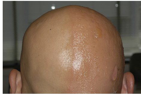
Fig 2. Vesiculobullous reaction on the treated side that occurred after increasing diphenylcyclopropenone concentration.

Initially, 2% DPCP in acetone is applied to a 4- × 4-cm circular area of the scalp to sensitize the patient. Two weeks later, a 0.001% DPCP solution is applied to the same half of the scalp (Fig 1). The concentration of DPCP is increased gradually each week until a mild dermatitis reaction is obtained. The goal is to achieve a low-grade erythema and mild pruritus on